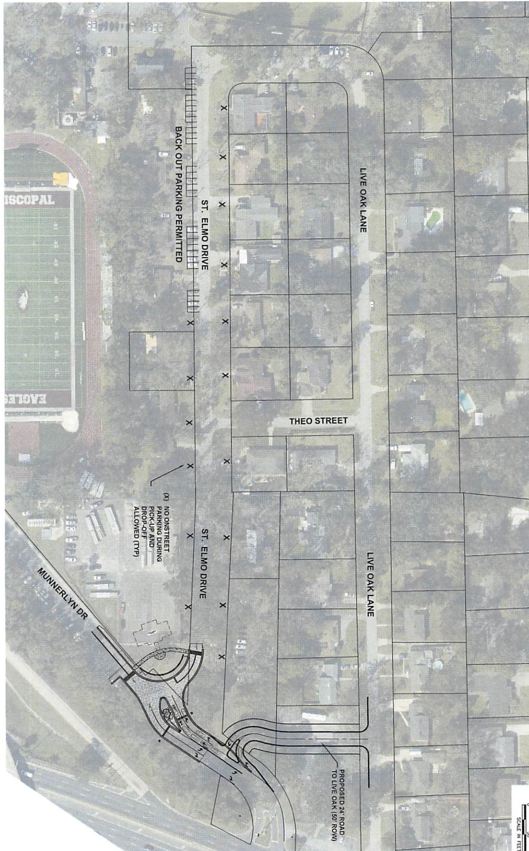
Exhibit 5 Page 1 of 1